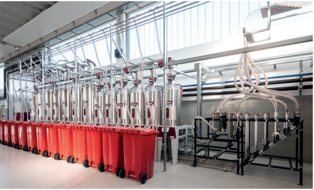
Top image: With eight automated and integrated injection molding machines from WITTMANN, ZECA has achieved great flexibility.

The central unit for drying and handling of the granulates supplies the injection molding machines with a wide range of materials.