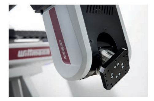
The cover photo shows a detailed shot of a robot with A+C servo axis for applications of 400 to 1,300 t of clamping force.