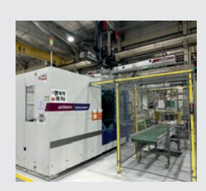
P. 10: WITTMANN machines, the most economical ones.