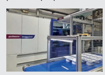
P. 16: Fit for future challenges.