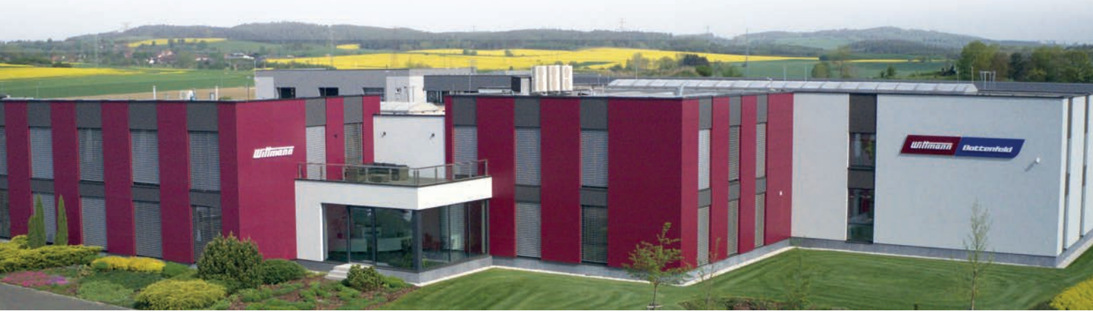
The Czech facility with a total floor space of 1600 square meters provides ample space for developing special customized solutions.

In customized automation solutions, not only the requirements for each application must be met, but also those for the specific local conditions. To enable optimal fulfilment of its customers' individual wishes, WITTMANN has therefore decentralized its automation technology division. Special departments for customized automation have been established in many subsidiaries, for example at WITTMANN BATTENFELD CZ spol. s. r. o. in Písek, Southern Bohemia.