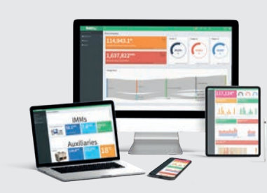
P. 7: iMAGOxt: keeping an eye on energy consumption in real time.