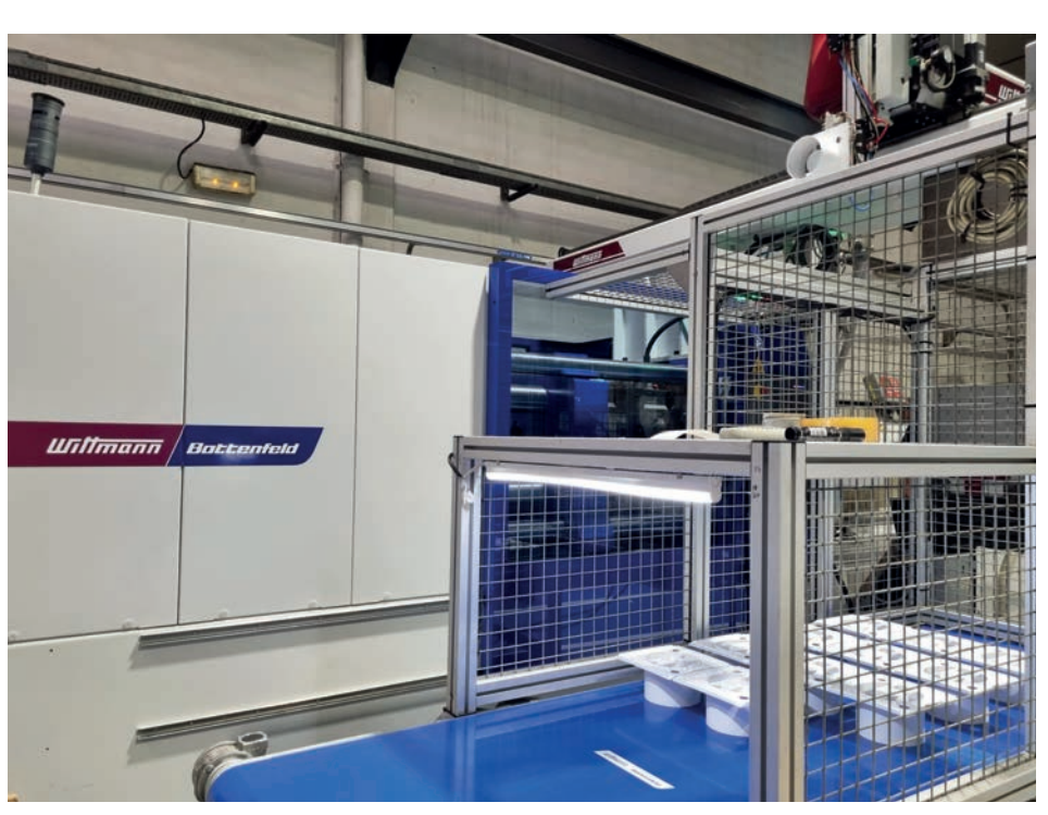
The automation ensures ergonomic workflows and reliable processes.

"We are enthusiastic about the flexibility of the WITTMANN robots", Viladecans comments, "especially because we can now restart production very quickly after a mold change." Here, too, the company benefits from the strategy of delivering everything from a single source. Via Wittmann 4.0, all components of the production cell are fully integrated. During setup of a mold already known to the machine, the pre-defined process parameters are set automatically in all participating system