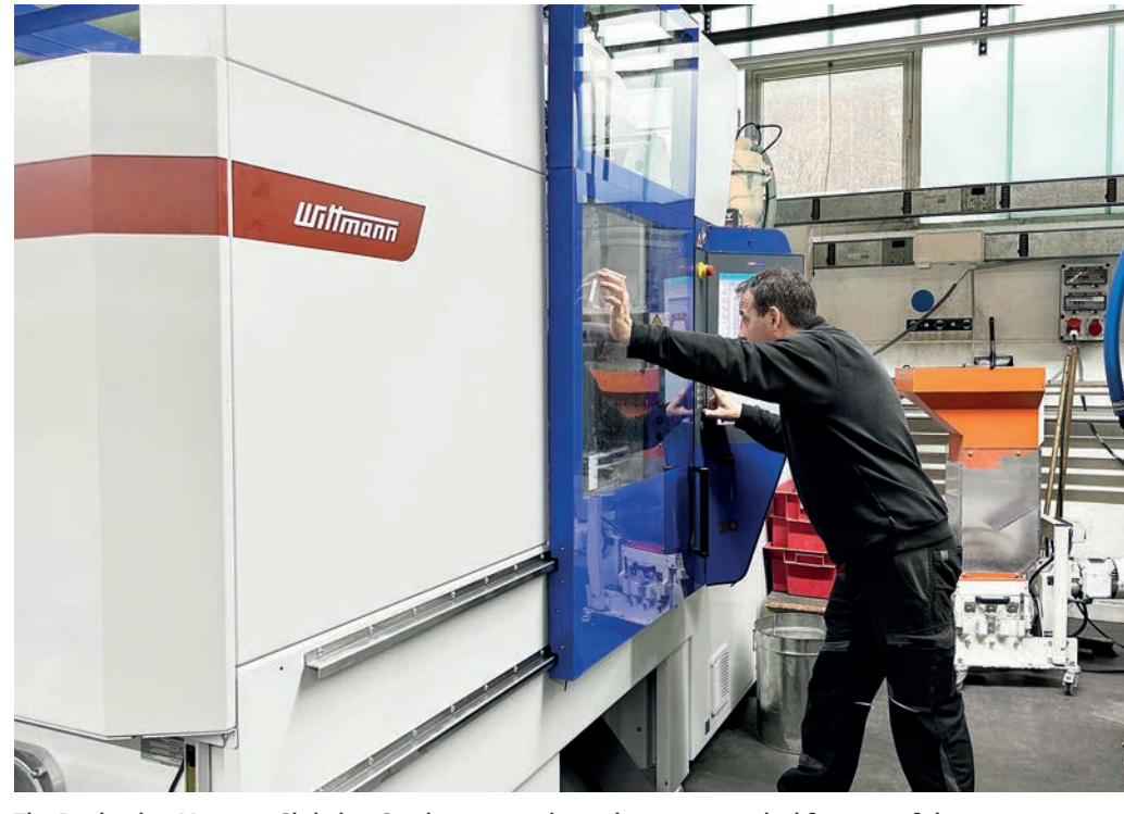
The Production Manager Christian Cassierer appreciates the many practical features of the WITTMANN machines.

Iris Langenberg is holding a particularly complex component in her hands. To be precise, a complete assembly consisting of 68 individual components. With few exceptions – such as circuit boards and switching elements – these are all thermoplastic parts, which are injection-molded in Gummersbach and subsequently assembled manually, together with the electronic components supplied by the customer. As a central part of