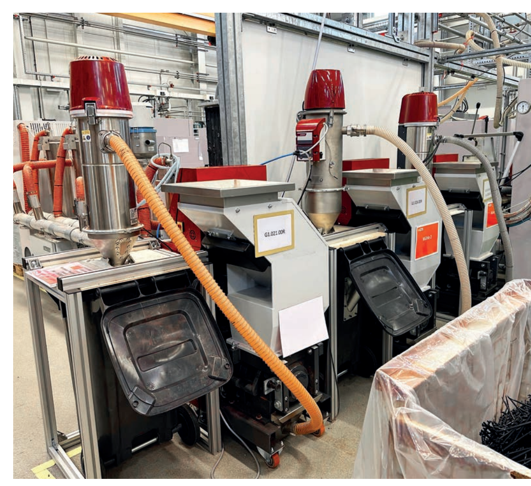
The new recycling center on the injection molding production floor: four S-Max 2 granulators from WITTMANN have been acquired for in-house recycling.

For a long time, it was considered impossible for customers to accept a proportion of recycled material in their parts. But the current demand for a circular economy has prompted the industry to rethink this point. "We have carried out numerous tests with recycled materials and thoroughly analyzed the quality of the injection molded parts", explains the injection molding department manager. "Many plugs have filigree structures with thin-walled areas. We had to make sure that we can fill the cavities completely and maintain the required product attributes with recycled material, too."