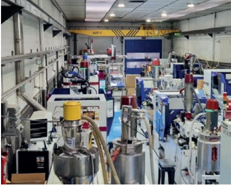
The modern machinery currently includes twelve injection molding machines, of which eight are from WITTMANN.

"We can teach the robots very easily for new tasks, such as placing inserts or IML labels, or programming additional rotary movements in the process sequence", says Viladecans. "Our production cells are now fit for the future. This will open doors to us for new orders and customer projects."