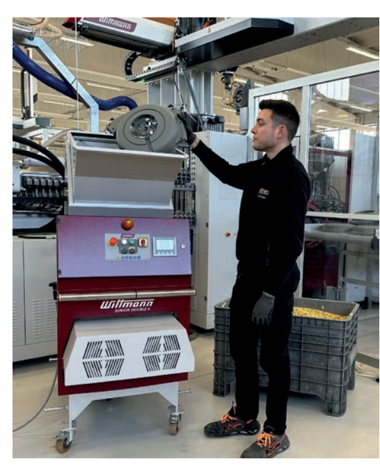
Sprue and reject parts are reground directly next to the machine.

injection molding facility has increased flexibility, improved the reliability of quality standards and thus achieved competitiveness. "We have now reached the level of efficiency required to serve our inefficient markets," Chiarabaglio sums up.