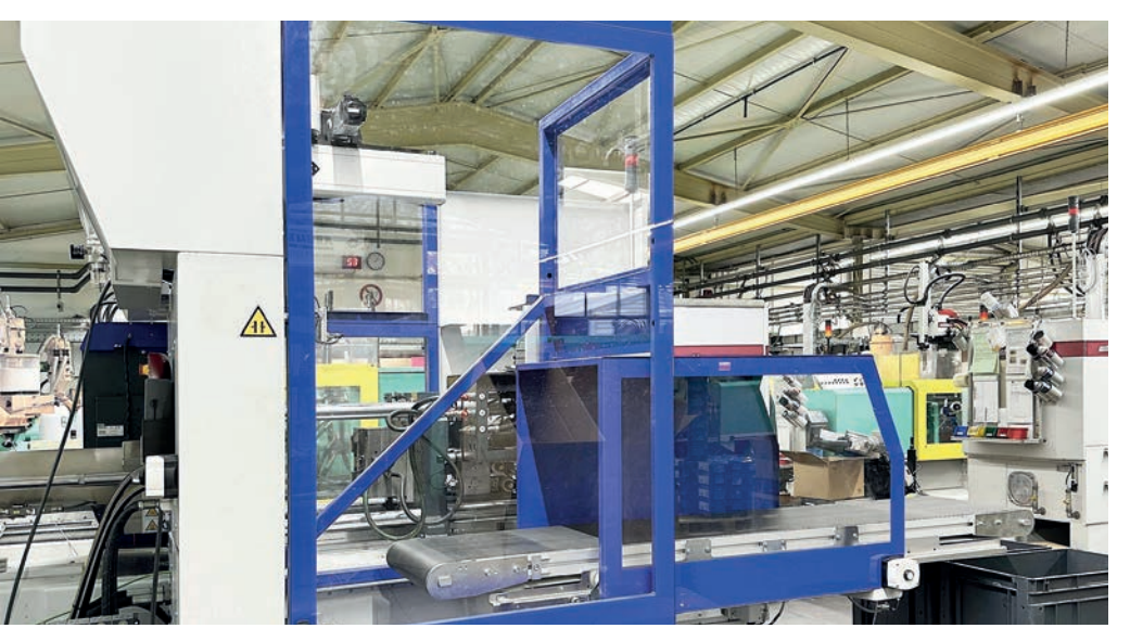
As integrated complete solutions, the production cells have only a small footprint.

switches, since before the crane manufacturer placed the order in Gummersbach, this assembly was a hybrid object made of plastic and metal. "Jointly with our customer, we developed the thermoplastic variant further in order to exploit the advantages of the plastic material more fully", reports Langenberg. "This proved a major success, since the parts' unit costs were reduced and the drive systems now reach a longer service life."