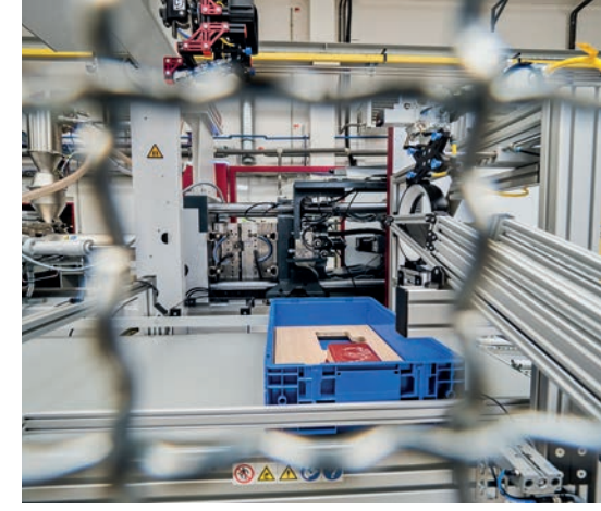
Image right: The fully automatic snack box production was presented for the first time at the 20th anniversary of WITTMANN BATTENFELD CZ last year (see text box).

Image above: This gripper has come from an in-house 3D printer as a unique customized solution. With its horizontal rotary servo axis, the gripper serves to move parts between several individual stations.