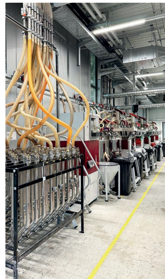
The granulate is fed into the materials handling system with gram-accurate precision by Gravimax gravimetric blenders from WITTMANN.

Since start-up of the in-house recycling project, the consumption of virgin material has gone down continuously, with an immediate effect on unit costs to improve the manufacturer's competitiveness. Most