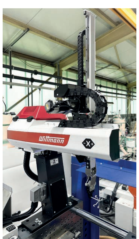
The new WX90 sprue removal systems are equipped with an R9 control system and thus completely integrated in the production cell.

winch drives in crane systems, this assembly is an important safety feature. These devices known as geared limit switches control the positioning of the crane hook. Depending on the type and size of the crane, the crane hook must be able to carry loads of up to 120 tons reliably.