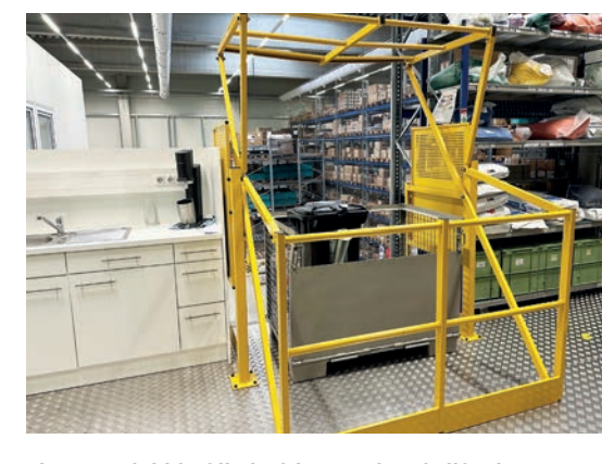
The material bin filled with granulate is lifted to the upper floor towards the central materials handling system, using a fork lift with sophisticated safety devices.