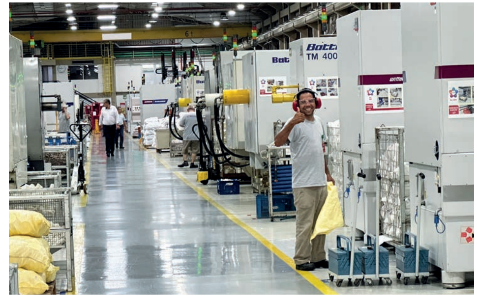
Large machines from WITTMANN dominate the scene at Krona's plant in Joinville. 75 WITTMANN machines are operating at this location alone.

Price pressure is high, and the product portfolio is extremely demanding. Fitting production requires elaborate molds with many core pulls. Accordingly, the molds take up a lot of space.