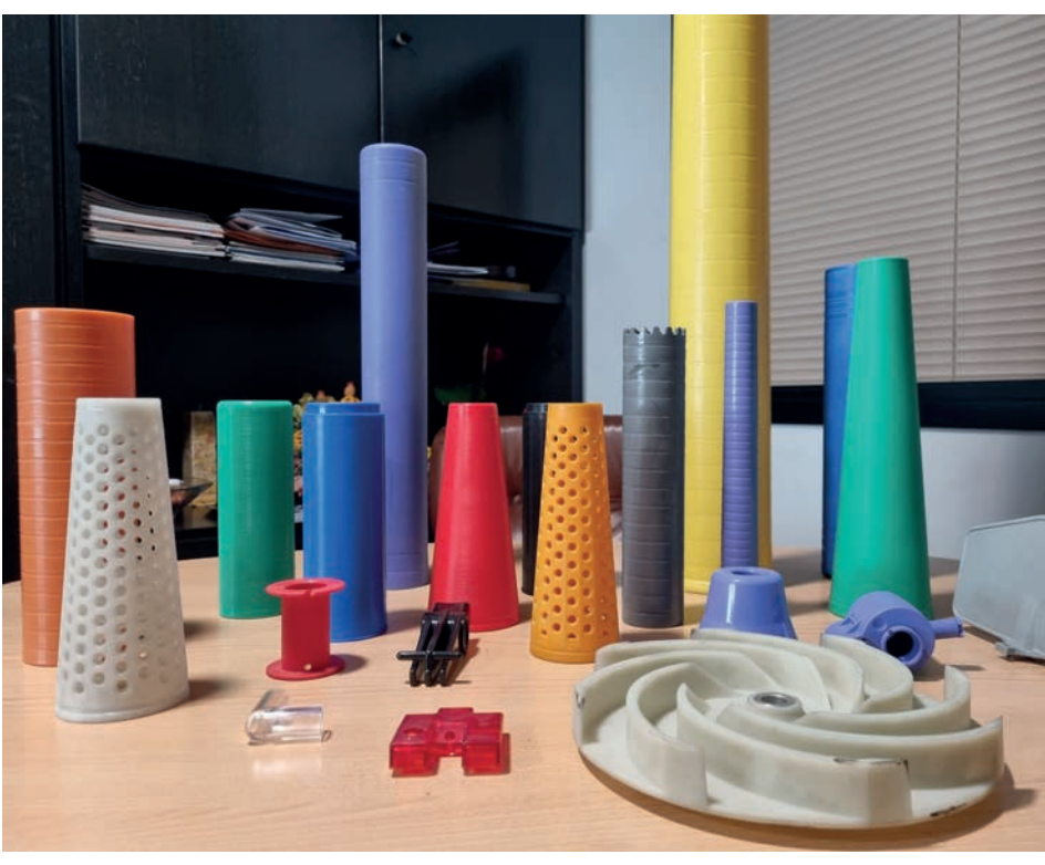
Cones, rollers, distaffs and many other components for textile processing machines make up a large proportion of the company's own product portfolio.

With its own in-depth tooling expertise, ANNA VILADECANS is able to offer its customers extensive service packages from a single source. "Upon request, we will act as a general contractor performing the