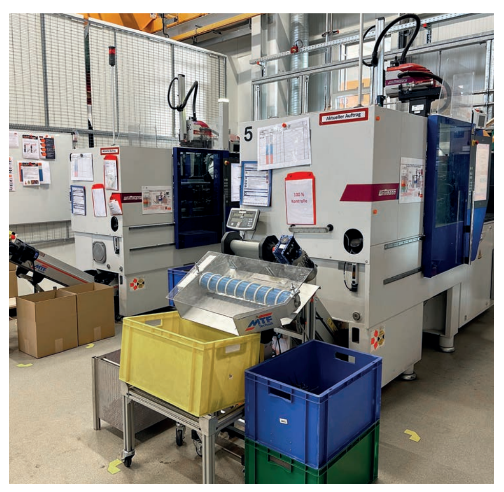
15 injection molding machines are installed at the plant. The newest machines are two SmartPower models from WITTMANN.

"Using recycled materials is our only way to achieve competitive unit costs", says the processor. "The new S-Max 2 screenless granulator series from WITTMANN have already amortized themselves within only six months."