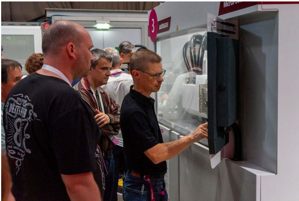
Fig. 4a-d: The guests were able to experience the WITTMANN Group's competence live on numerous interesting exhibits.