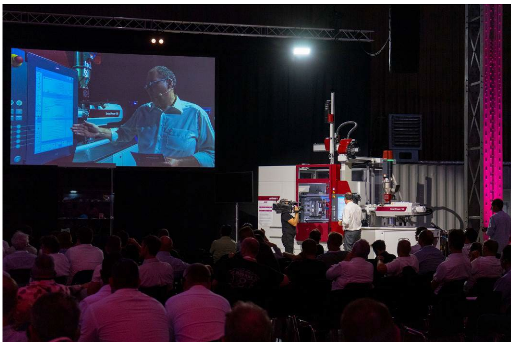
Fig. 3: The specialist presentations centered around the theme of digitalization.