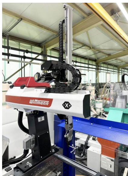
Fig. 2: The new WX90 sprue removal systems with rotary servo axes are equipped with an R9 control system and thus completely integrated in the production cell.