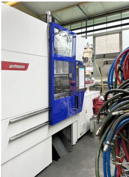
Fig. 4: The new SmartPower injection molding machines increase the energy efficiency of the injection molding production.