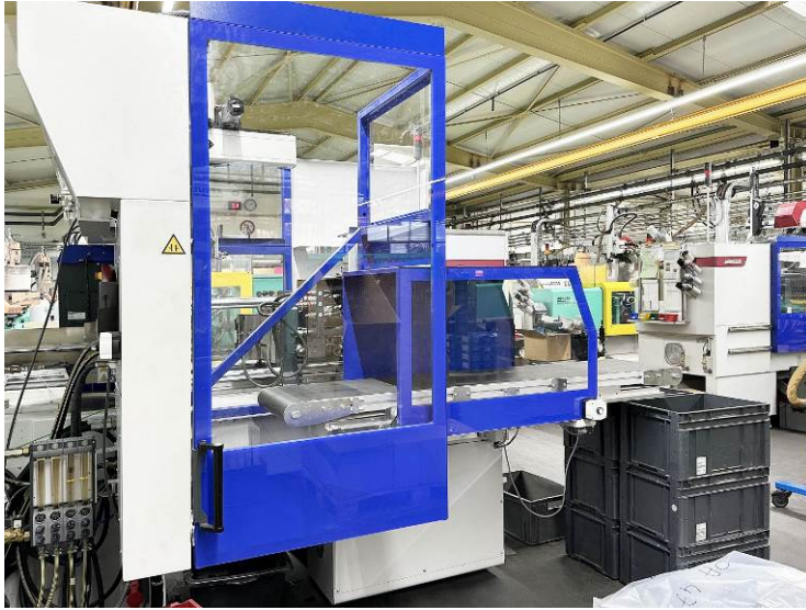
Fig. 5: As integrated complete solutions, the production cells have only a small footprint.